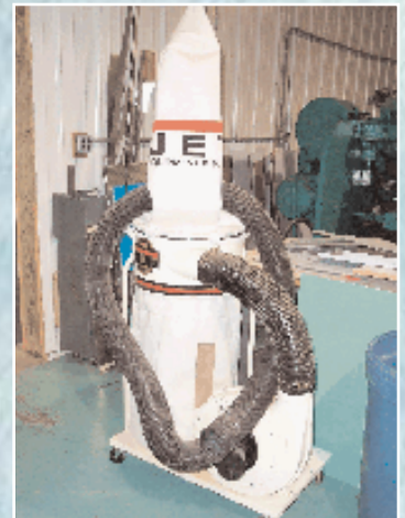
DELTA PORTABLE DUST COLLECTOR