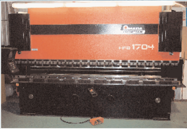
1999 AMADA HFB 1704/8, 187-TON CNC HYDRAULIC PRESS BRAKE, 13'8" BENDING LENGTH, 8-AXIS BACKGAUGE, S/N OH990909