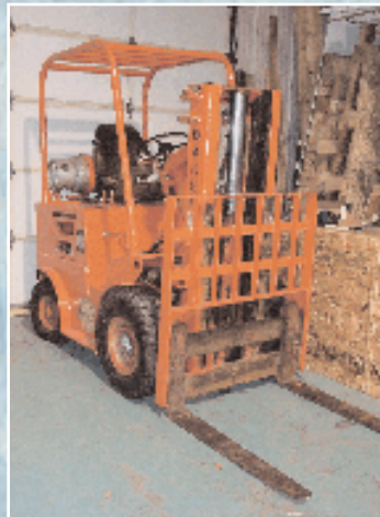
BAKER 3,500-LB. CAPACITY PROPANE FORKLIFT

Large Quantity of Power and Hand Tools Together with Many Miscellaneous Plant Items!