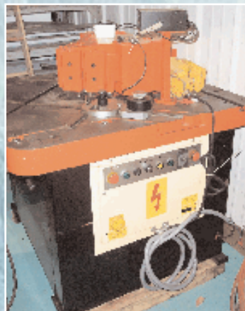
AMADA CSHW-220, 8" x 1/4" NOTCHER/COPER, w/DIGITAL READOUT, S/N 22000255