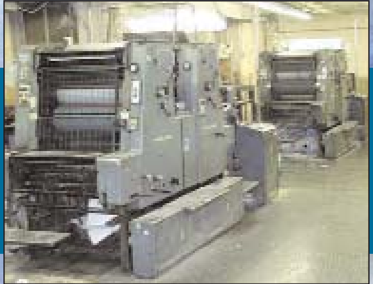
(3) HEIDELBERG MDL. MOZP 2-COLOR PRESSES

WELL-MAINTAINED SHEET-FED PRINTING PLANT FEATURING (9) HEIDELBERG OFFSET PRINTING PRESSES