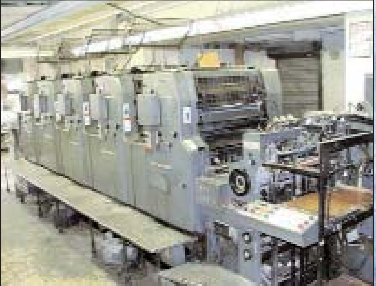
HEIDELBERG MDL. MOFP 5-COLOR PRESS, S/N 606 315