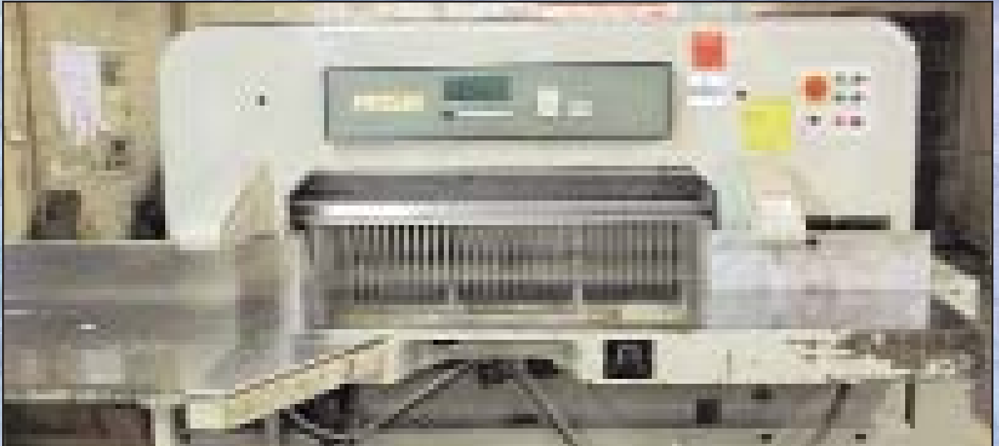
PRISM 45" POWER PAPER CUTTER