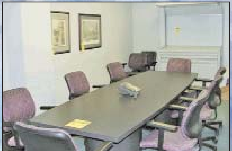
> LARGE QUANTITY OF QUALITY OFFICE FURNITURE