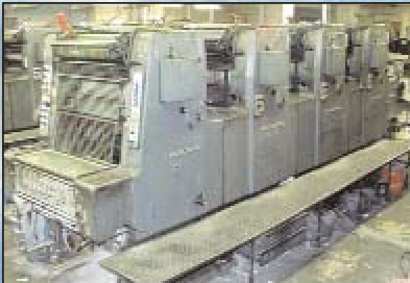
< HEIDELBERG MDL. MOV P 4-COLOR PRESS, S/N 606 258