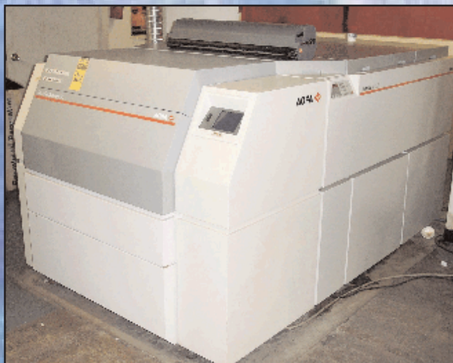
(2) AGFA SELECTSET AVANTRA 30 OLP PROCESSORS

BRYCE Addressing System; CHESHIRE Labeling Base, BELL & HOWELL 8-Pocket Inserter; (3) TEANECK & DOUTHITT Vacuum Frames; AGFA & HOECHST Processors; AGFA APL32 Laminator; Light Tables; Film Punches; Flat Files; Densitometers; Cubicles; Desks; Chairs; Files; Bookcases; Conference Room; Artwork; Assorted Computers and Printers; (2) XEROX Copiers and Much More!