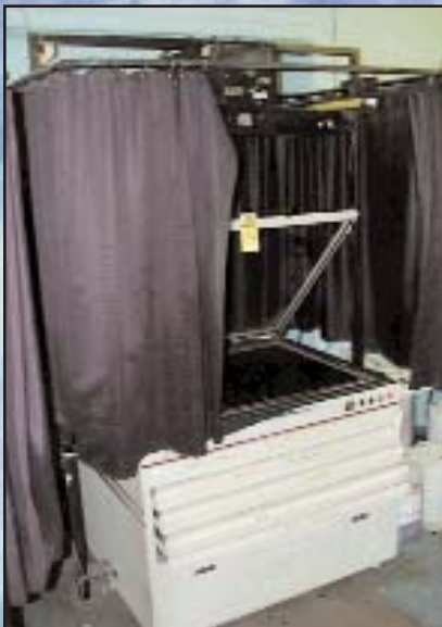
< LARGE PREPRESS DEPARTMENT