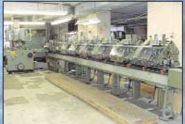
> (2) MULLER MARTINI 6-STATION SADDLE BINDING LINES

Thinking of Selling Your Business or Machinery? Contact Caspert Management for a Free No-Obligation Evaluation